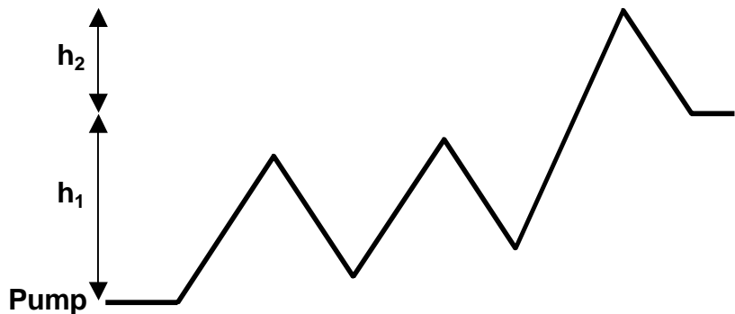
Figure 4 shows a pipeline with several up and down legs in series. In this example, each down leg produces a siphon effect and the total head seen by the pump, once the line is filled, is equal to h_1 plus the friction in the line due to flow.

Although piping systems that rise and fall can take advantage of the siphon effect, they are also vulnerable to entrained or dissolved air accumulation at their high points. If not properly vented, air pockets can reduce and, in some cases, completely prohibit flow through the system. The chance of this occurring is increased in piping systems with multiple up and down legs. If air is trapped in these upper areas and flow is maintained, the elevation head required to maintain flow will be h_1 plus the sum of the heights of the air pockets in each down leg.